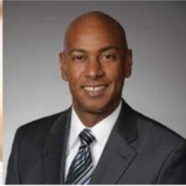
Gareth Elliott Sacramento Advocates California State Gov; former senior official in CA state legislature and U.S. Congress