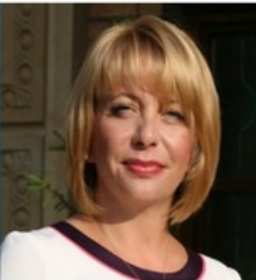
Kateryna Yushchenko Intermarium Strategy Ukraine and Europe; former KPMG executive and First Lady of Ukraine, advisor to numerous organizations